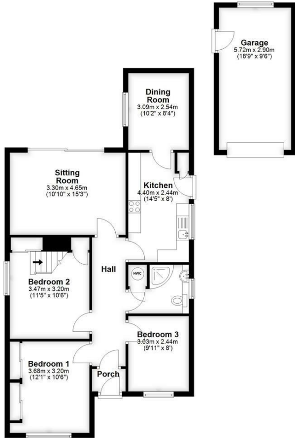
Total area: approx. 115.1 sq. metres (1238.7 sq. feet)